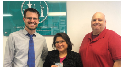
Adjustment of Status Through Marriage New Green Card Holder From The Philippines

“My husband and I had a very positive experience and outcome using Landerholm Immigration. The process was actually faster than we thought and were quoted. We live 90 minutes away but found Landerholm Immigration to be worth the travel!”