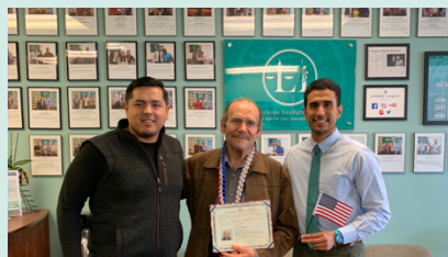
Naturalization: New U.S. Citizen Originally From Mexico