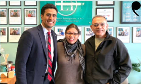
Asylum Granted Originally From Venezuela