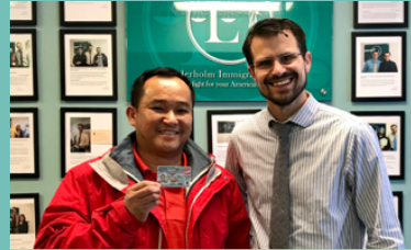
Replacement of Green Card Holder From Laos

“Working with Landerholm Immigration is one of the best decisions of my life. From the beginning to the end the team was very helpful and made sure I was updated with everything that was happening.”