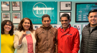
Adjustment of Status Through Marriage New Green Card Holder From Mexico

“ My experience with the Landerholm Immigration Office was very satisfactory, in attention, communication and patience. I want to thank you for your work and for helping achieve receiving my greencard.