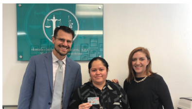
Green Card Granted Through U-Visa Client From El Salvador

★★★★★ “ Thanks to you I received my residency quickly. Thank you for your support and thank you for your support and thank you very much for your attention. Thanks for my residency. ”