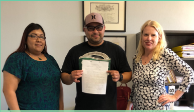
Asylum Approval Client From El Salvador